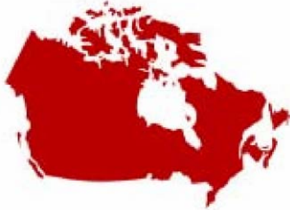
G7 Labour Cost Comparison (Rank)